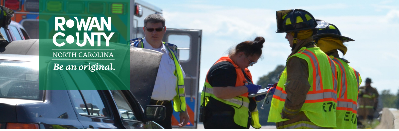
Job Opportunity Announcement